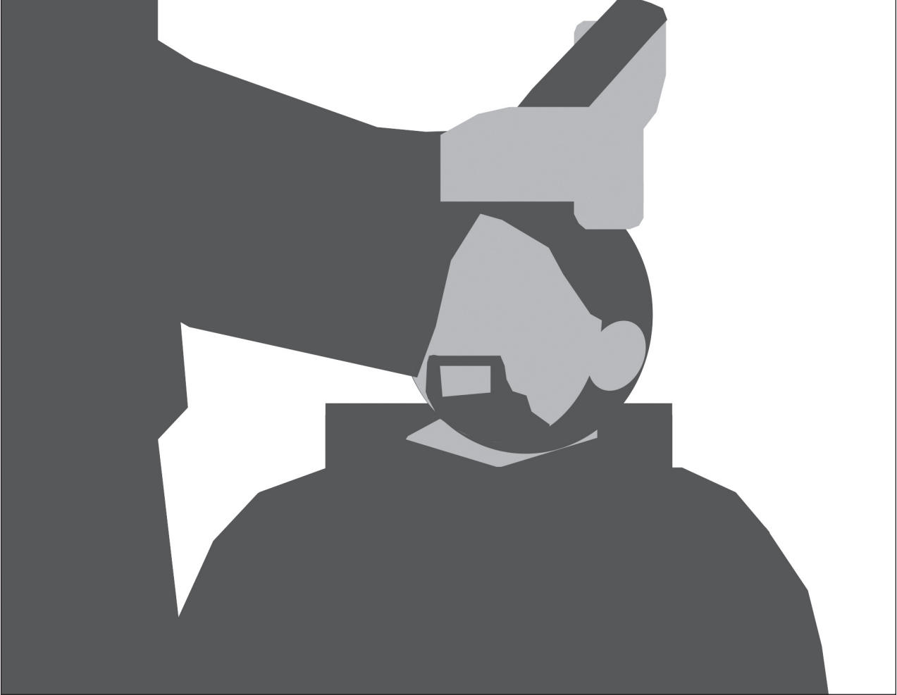
ILLUSTRATION BY JOHN BRICKER

Producer Hit-Boy’s beat shows off some promising elements, stacking touches